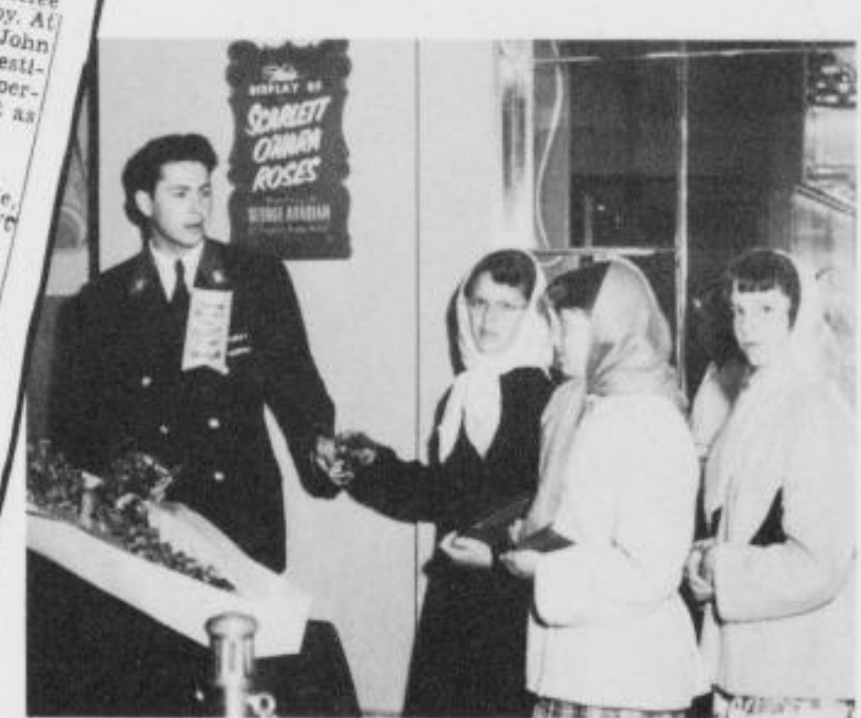
SCARLETT ROSE GIVEAWAYS!