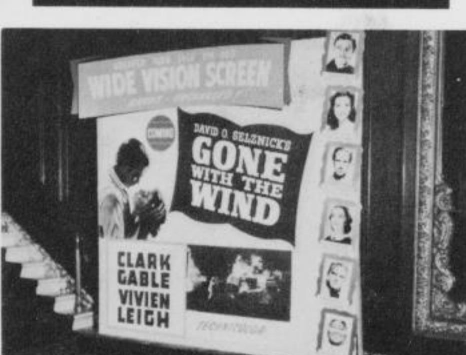
GIANT LOBBY DISPLAY!

READ THE BOOK "GONE WITH THE WIND" AVAILABLE AT YOUR PUBLIC LIBRARY SEE DAVID O. SELZNICK'S "GONE WITH THE WIND" TECHNOLOR UNCL. UNCHANGED Starts Thursday, June 3rd LOEW'S MIDLAND