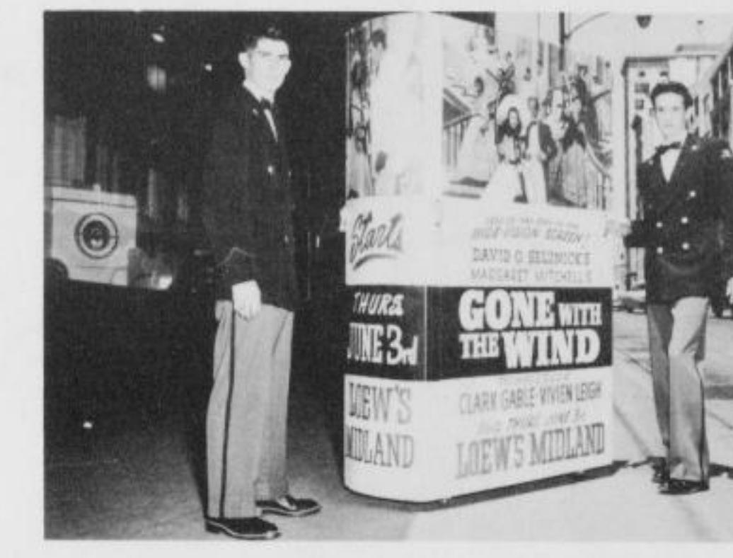
BIG WALKING BOOK!