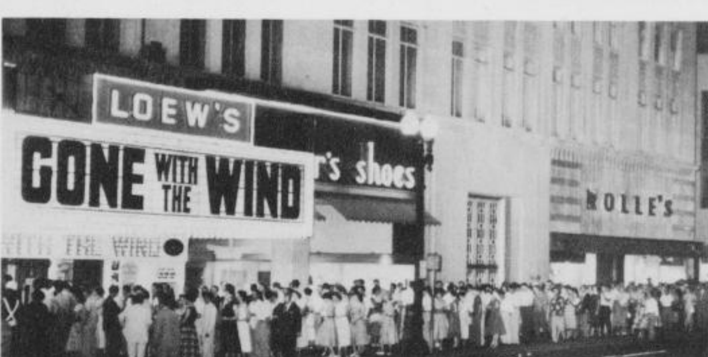
ANOTHER BIG THEATRE CROWD!