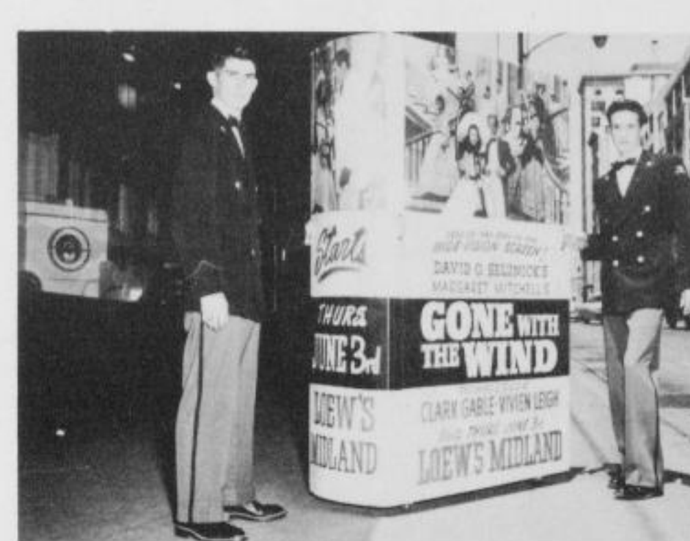
BIG WALKING BOOK!