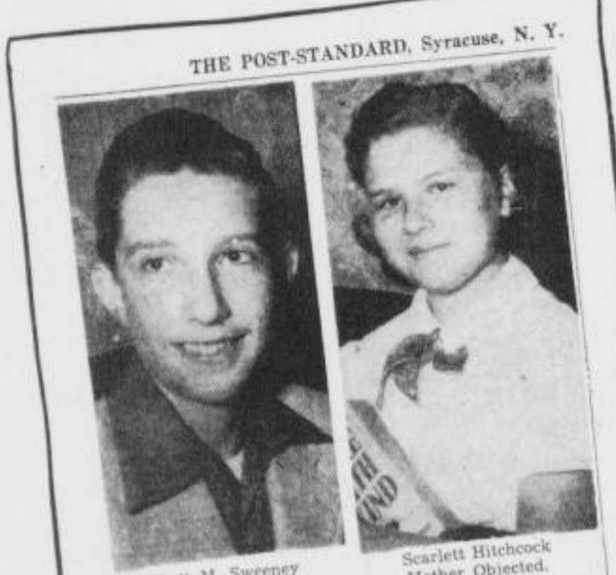
Scarlett, Rhett Named After Stars of Movie

CHRISTENED RHETT AND SCARLETT 14 YEARS AGO. FOUND AND EXPLOITED IN GREAT NEWSPAPER, TV PROMOTIONS!