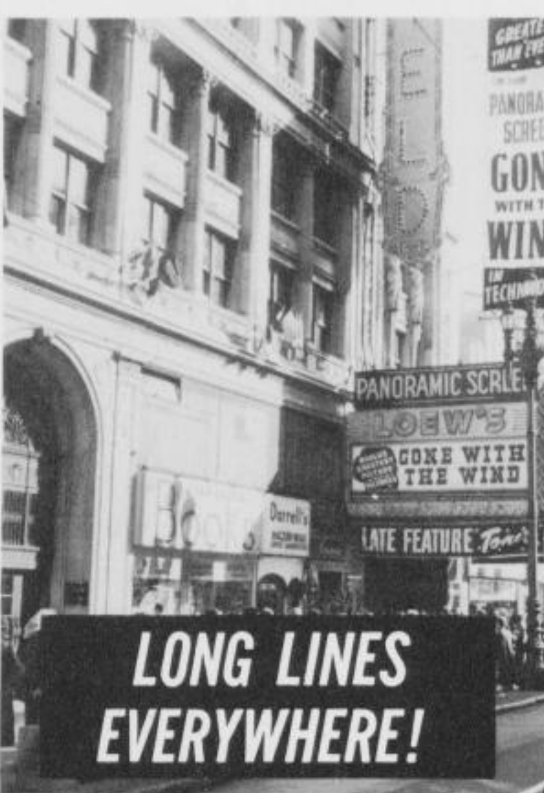
LONG LINES EVERYWHERE!

WOMAN WAITS FOR BOX-OFFICE OPENING! STUNT CRASHES NEWSPAPERS AND TV!