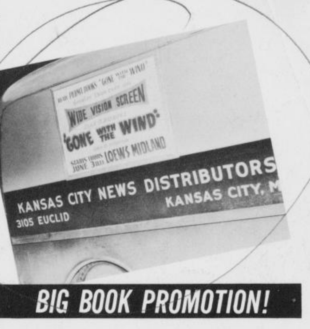
BIG BOOK PROMOTION!

READ THE BOOK "GONE WITH THE WIND" AVAILABLE AT YOUR PUBLIC LIBRARY SEE DAVID O. SELZNICK'S "GONE WITH THE WIND" TECHNOLOR UNCL. UNCHANGED Starts Thursday, June 3rd LOEW'S MIDLAND