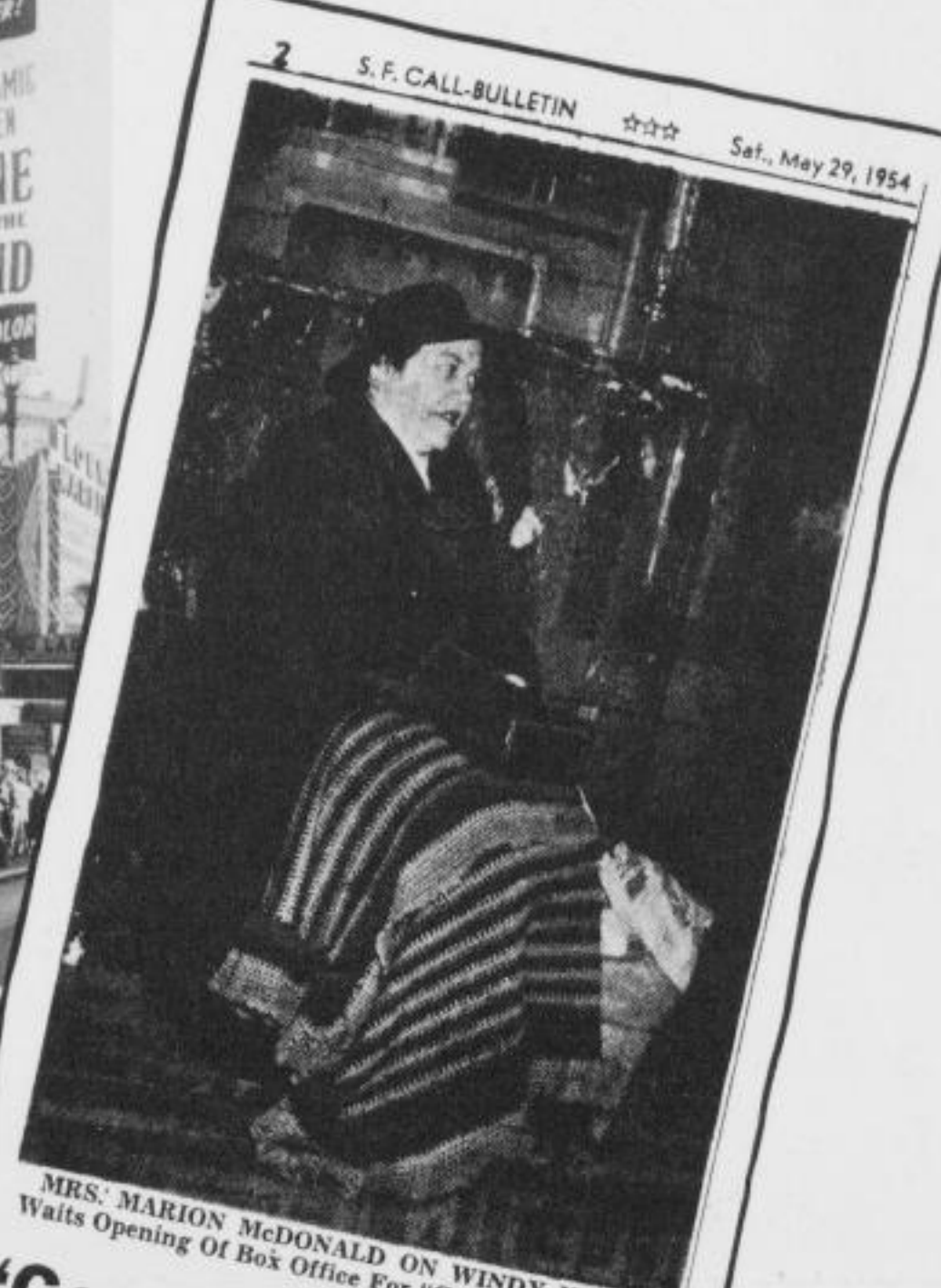
'Gone' Won't Go Unseen This Time

WOMAN WAITS FOR BOX-OFFICE OPENING! STUNT CRASHES NEWSPAPERS AND TV!