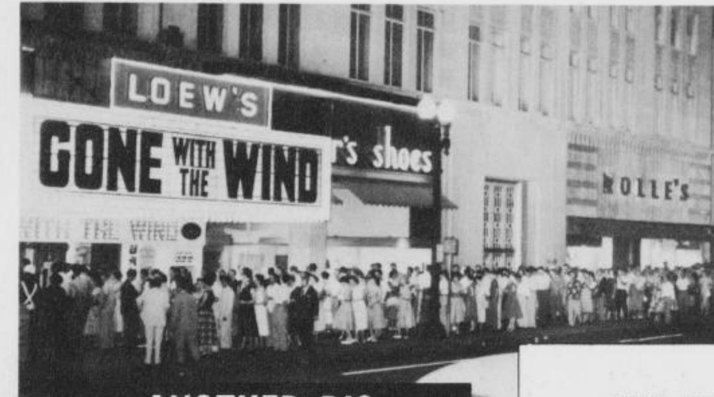
ANOTHER BIG THEATRE CROWD!