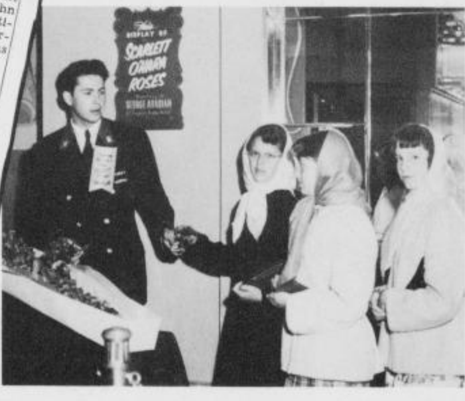
SCARLETT ROSE GIVEAWAYS!