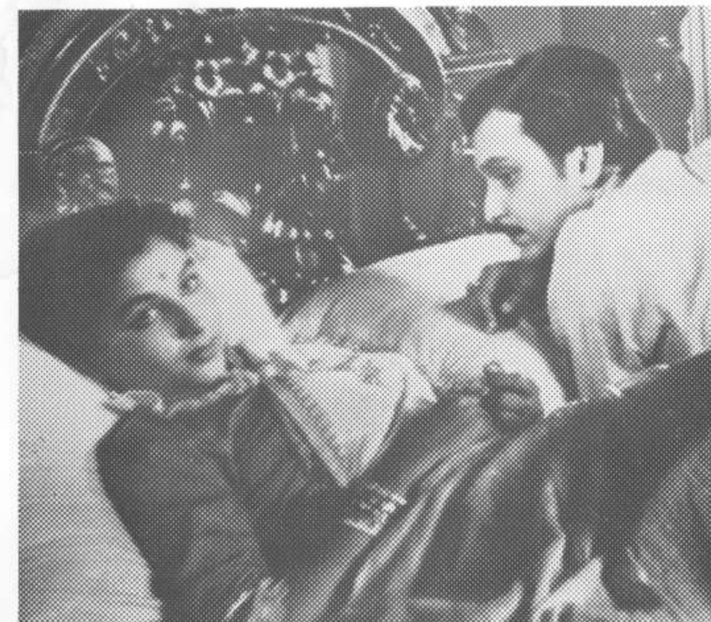
DEVI Scene MAT 2A TEAMED FOR DRAMA are Sharmila Tagore and Soumitra Chatterjee, the memorable lovers in the "World of Apu," who are reunited as stars of "Devi" (The Goddess), the new Satyajit Ray production opening . . . at the . . . Theatre. It is Ray's first film since his widely acclaimed "Apu" trilogy.

Over a period of 3 months, 45 shooting days were spent on "Devi."