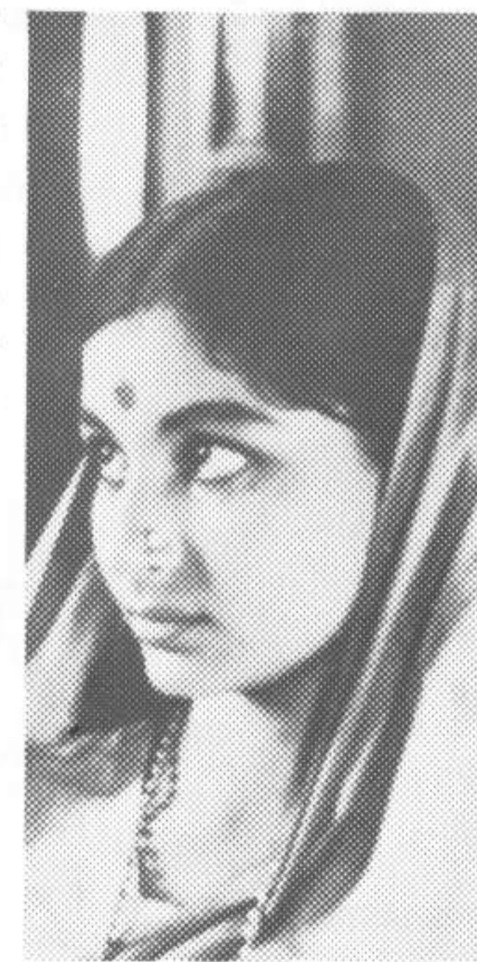
DEVI Scene MAT 1A BEAUTIFUL Sharmila Tagore stars in "Devi" (The Goddess), Satyajit Ray's first film since his "Apu" trilogy, which arrives . . . at the . . . Theatre.

When it was released in India, "Devi" so shocked some government authorities that it was ordered banned from export. It was freed from the prohibition only through the intercession of Prime Minister Nehru himself.