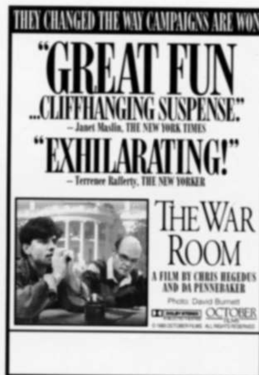
Ad 103 1 col x 3" = 3"