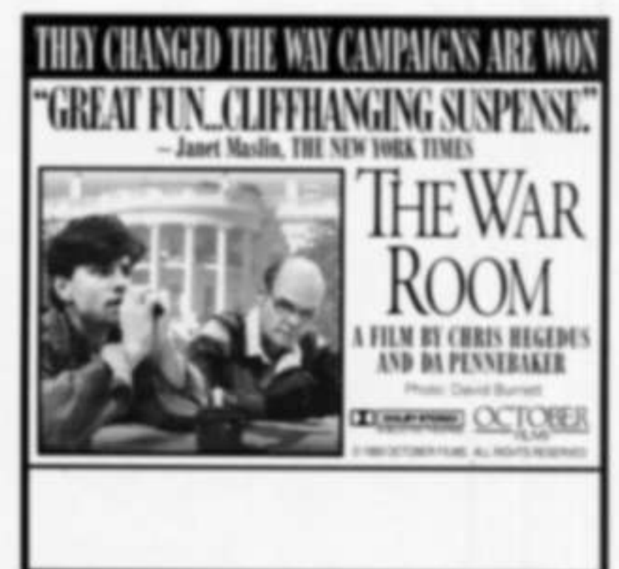
Ad 102 1 col x 2" = 2"