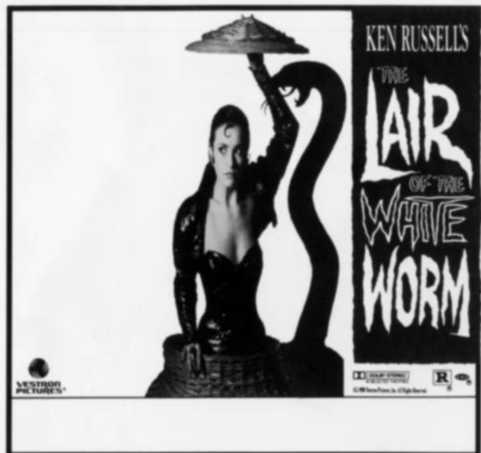
AD 203 2 cols. x 4" = 8 col. inches--review