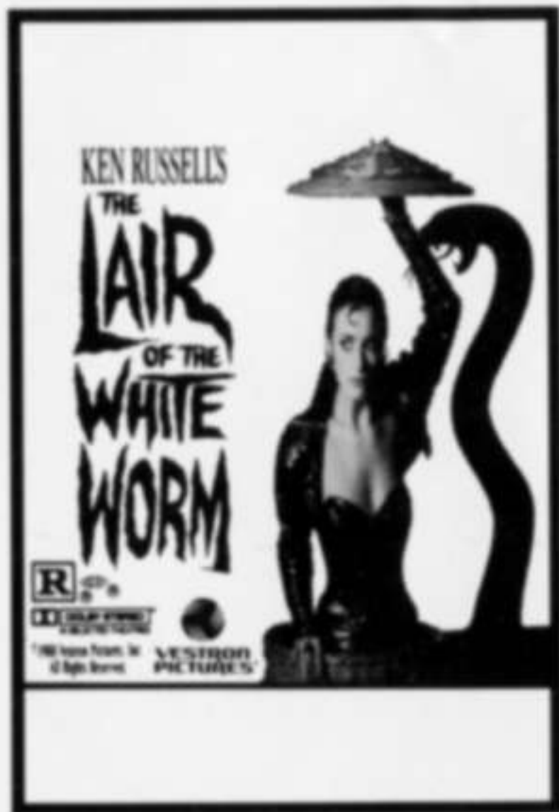
AD 103 1 col. x 3" = 3 col. inches--review