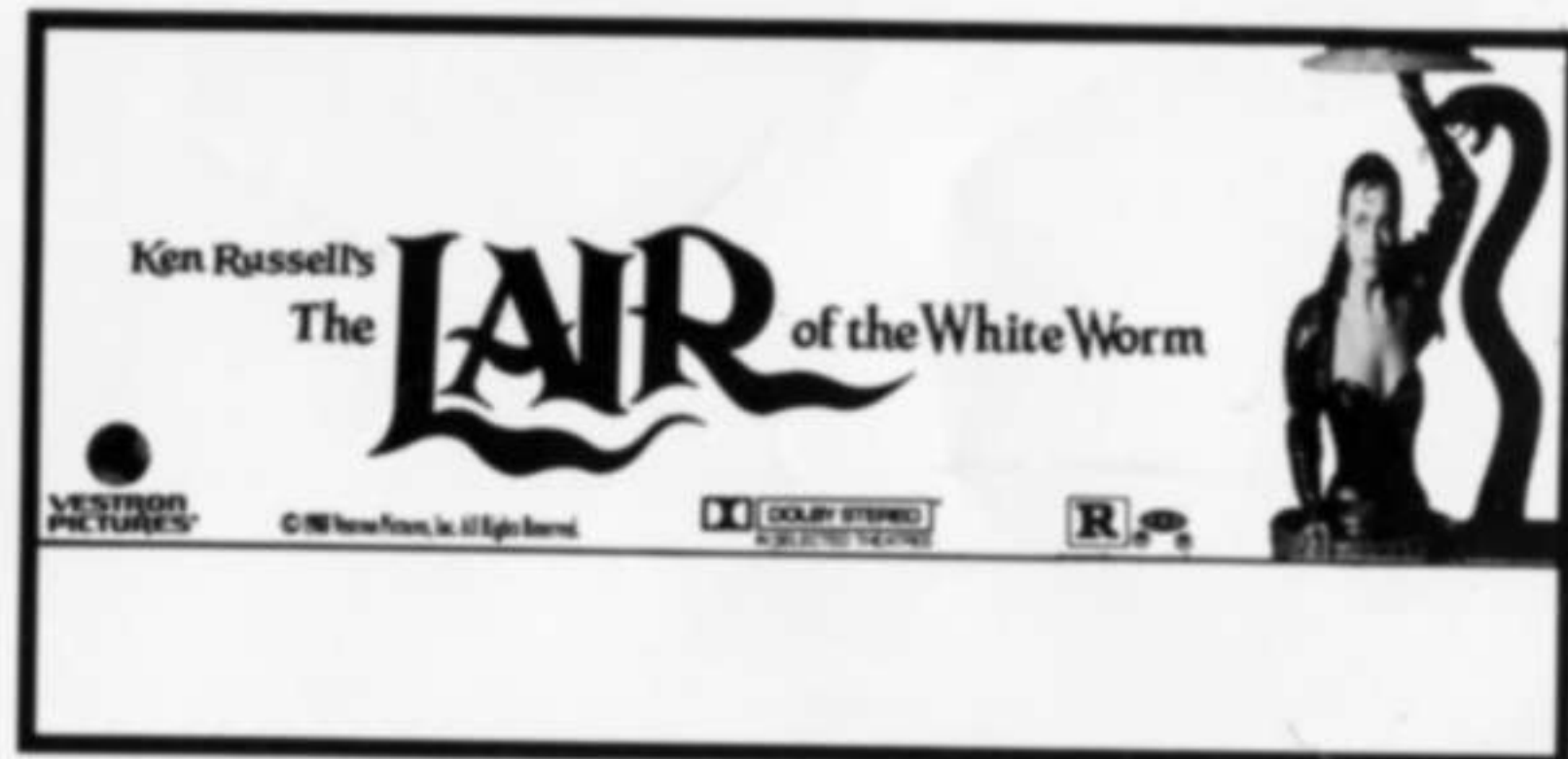
AD 201 2 cols. x 2" = 4 col. inches--review