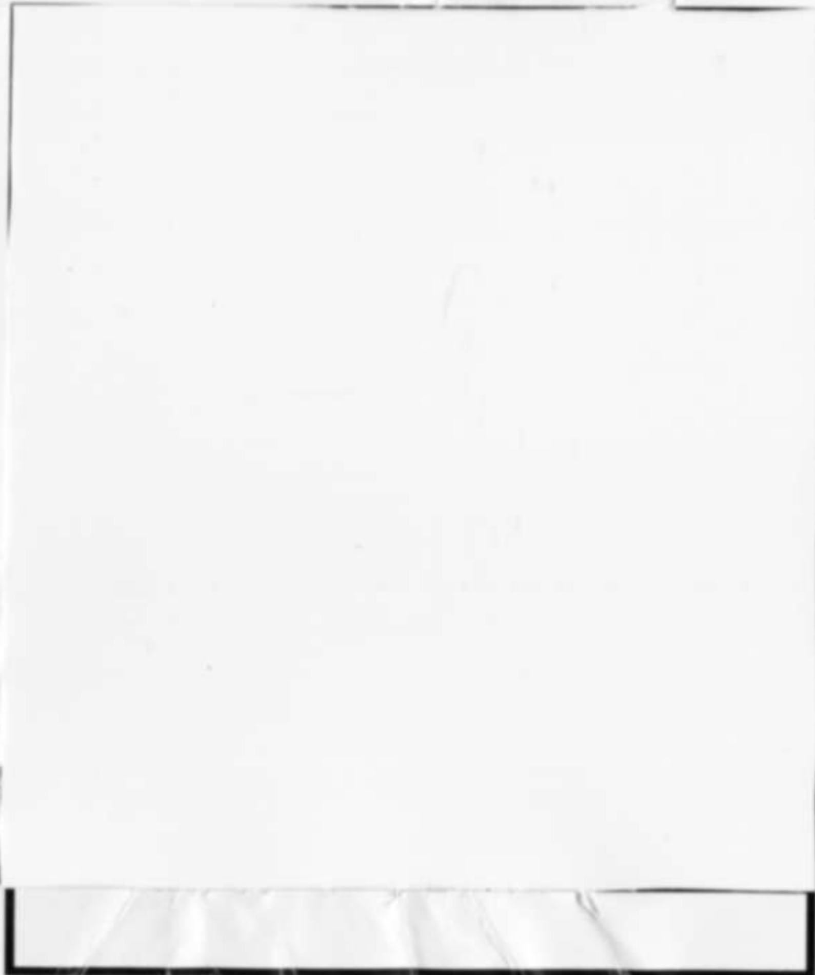
AD 204 2 cols. x 5" = 10 col. inches