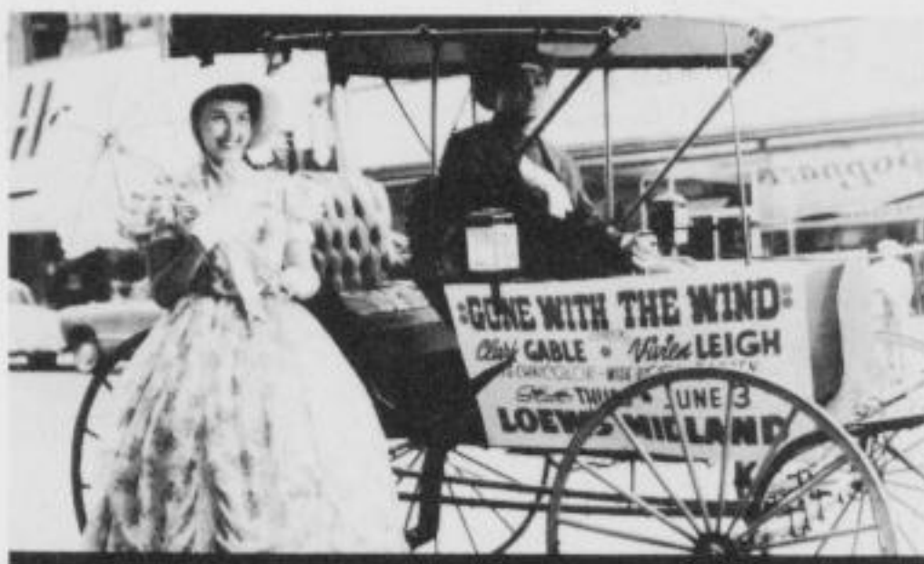
SCARLETT WITH HORSE AND BUGGY BALLYHOO!