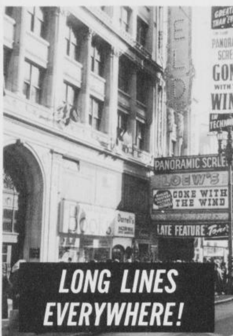
LONG LINES EVERYWHERE!

WOMAN WAITS FOR BOX-OFFICE OPENING! STUNT CRASHES NEWSPAPERS AND TV!