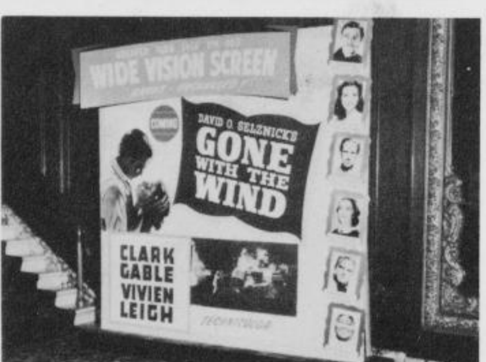
GIANT LOBBY DISPLAY!

READ THE BOOK "GONE WITH THE WIND" AVAILABLE AT YOUR PUBLIC LIBRARY SEE DAVID O. SELZNICK'S "GONE WITH THE WIND" TECHNOLOR UNCL. UNCHANGED Starts Thursday, June 3rd LOEW'S MIDLAND