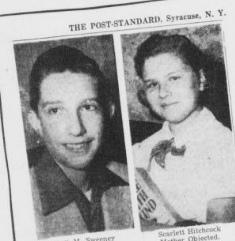
Scarlett, Rhett Named After Stars of Movie

CHRISTENED RHETT AND SCARLETT 14 YEARS AGO. FOUND AND EXPLOITED IN GREAT NEWSPAPER, TV PROMOTIONS!