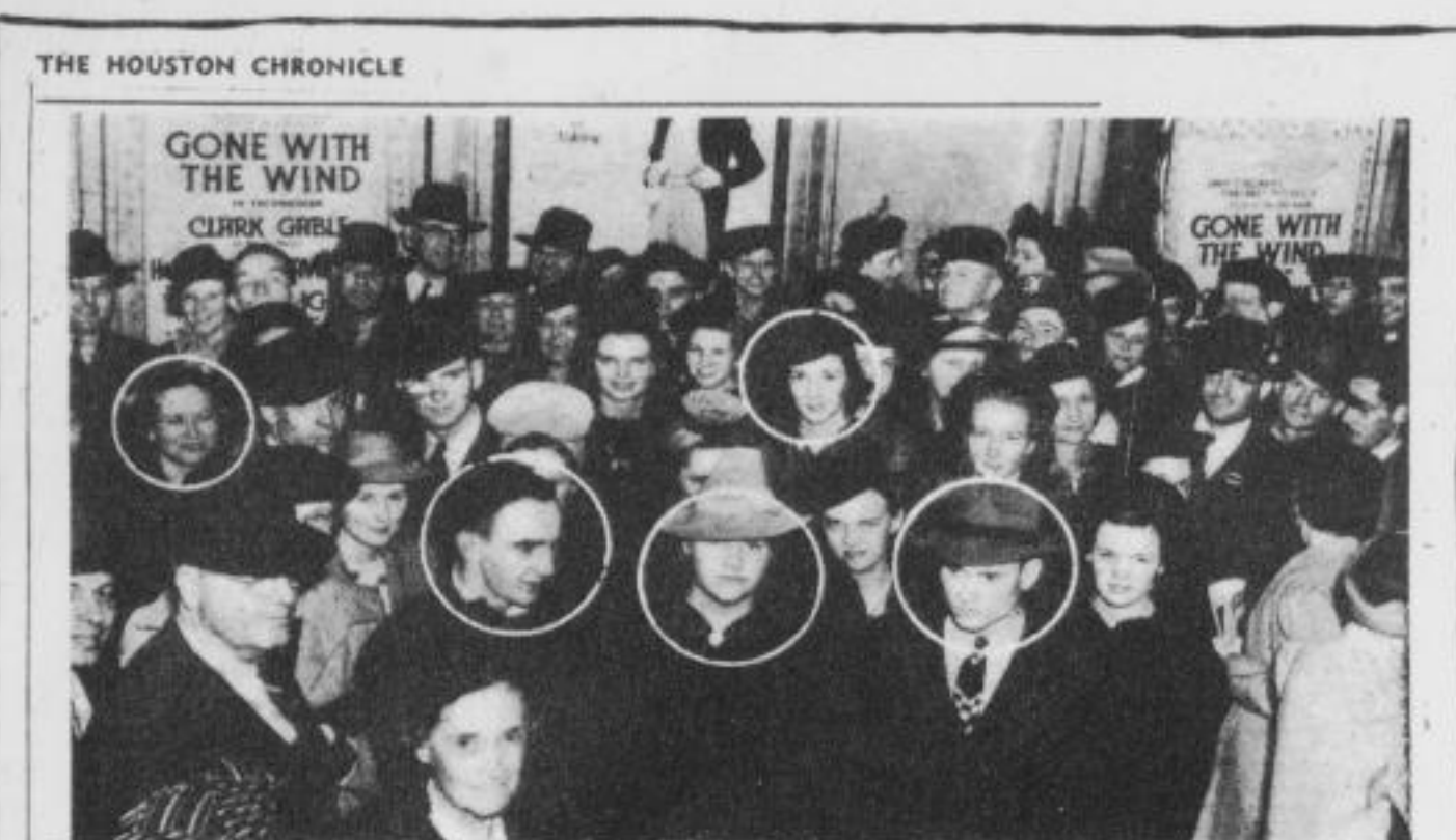
WERE YOU THERE FEBRUARY 7, 1940?