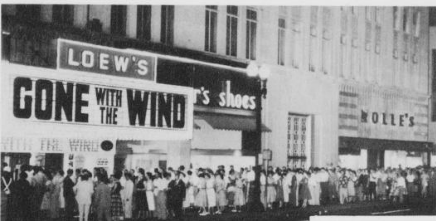
ANOTHER BIG THEATRE CROWD!