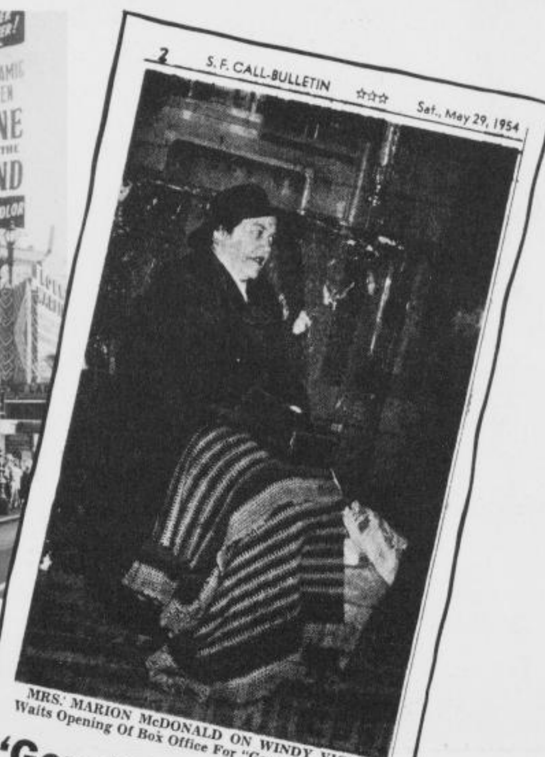
'Gone' Won't Go Unseen This Time

WOMAN WAITS FOR BOX-OFFICE OPENING! STUNT CRASHES NEWSPAPERS AND TV!