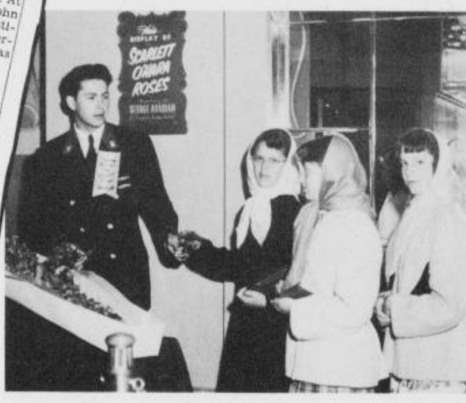
SCARLETT ROSE GIVEAWAYS!