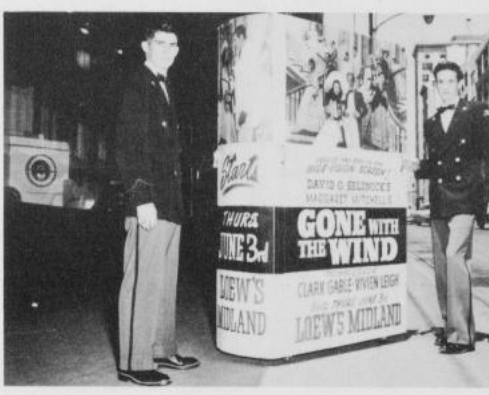
BIG WALKING BOOK!